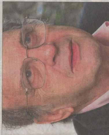
Playwright and screenwriter Sir Ronald Harwood

Born in Cape Town, South Africa in 1924, he moved to the UK in 1951.